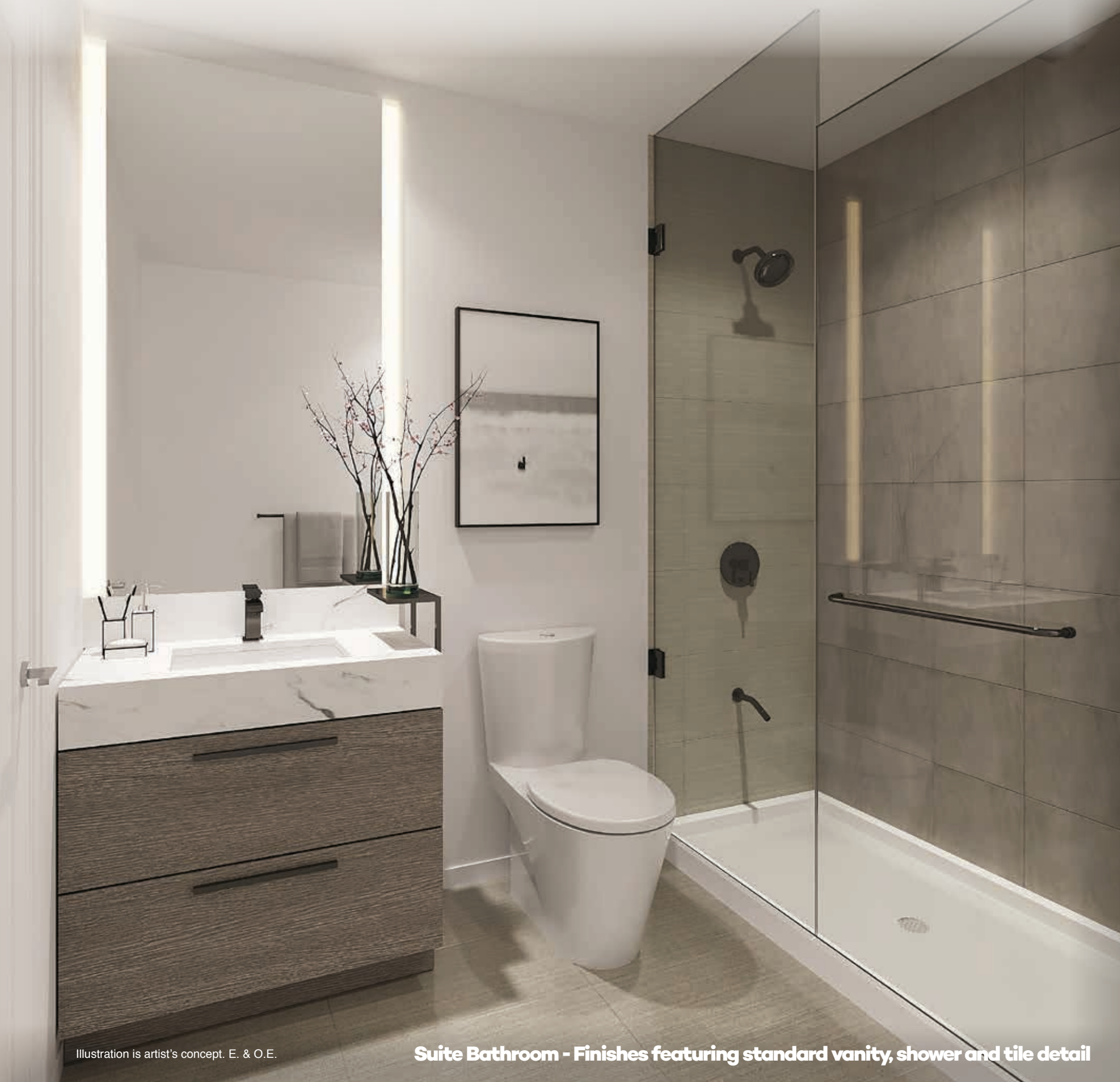
Illustration is artist's concept. E. & O.E.