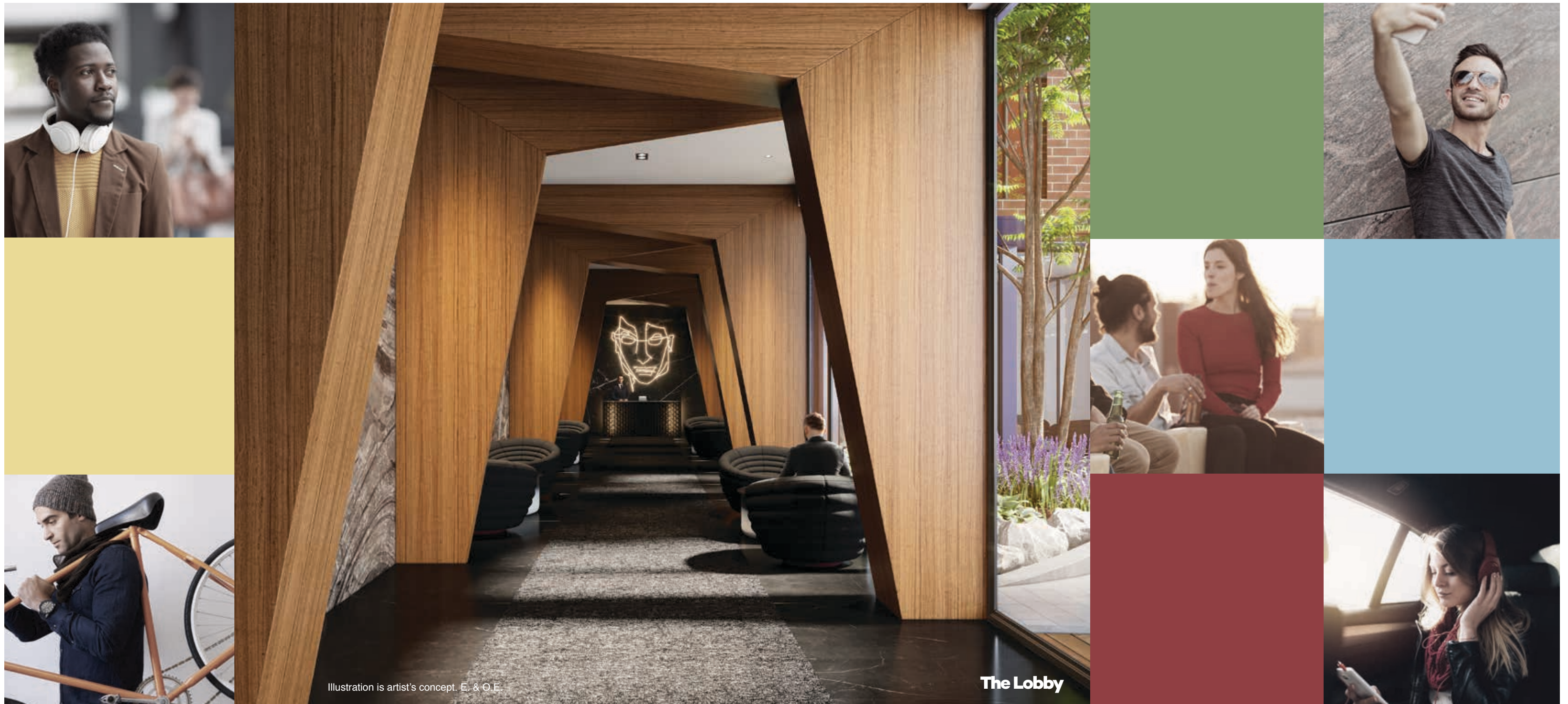
Illustration is artist's concept. E. & O.E.

Upon entering JAC, you're greeted by a friendly concierge who is ready to help. The lobby is complete with stunning interior architecture that defines the entry passage. It features various places to sit and enjoy the view of the Outdoor Courtyard. Make your way to the Fireside Lounge, a casual gathering place overlooking the Courtyard. It's the perfect place to wait for your Uber... or pickup your Amazon package.