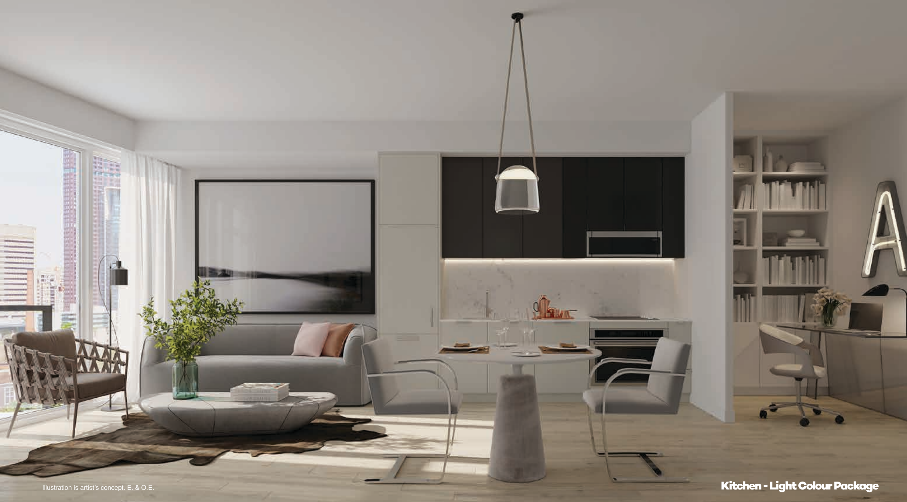
Illustration is artist's concept. E. & O.E.