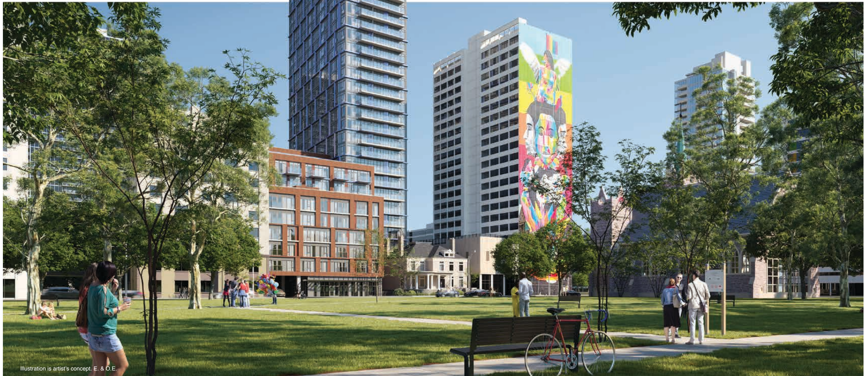
Illustration is artist's concept. E. & O.E.