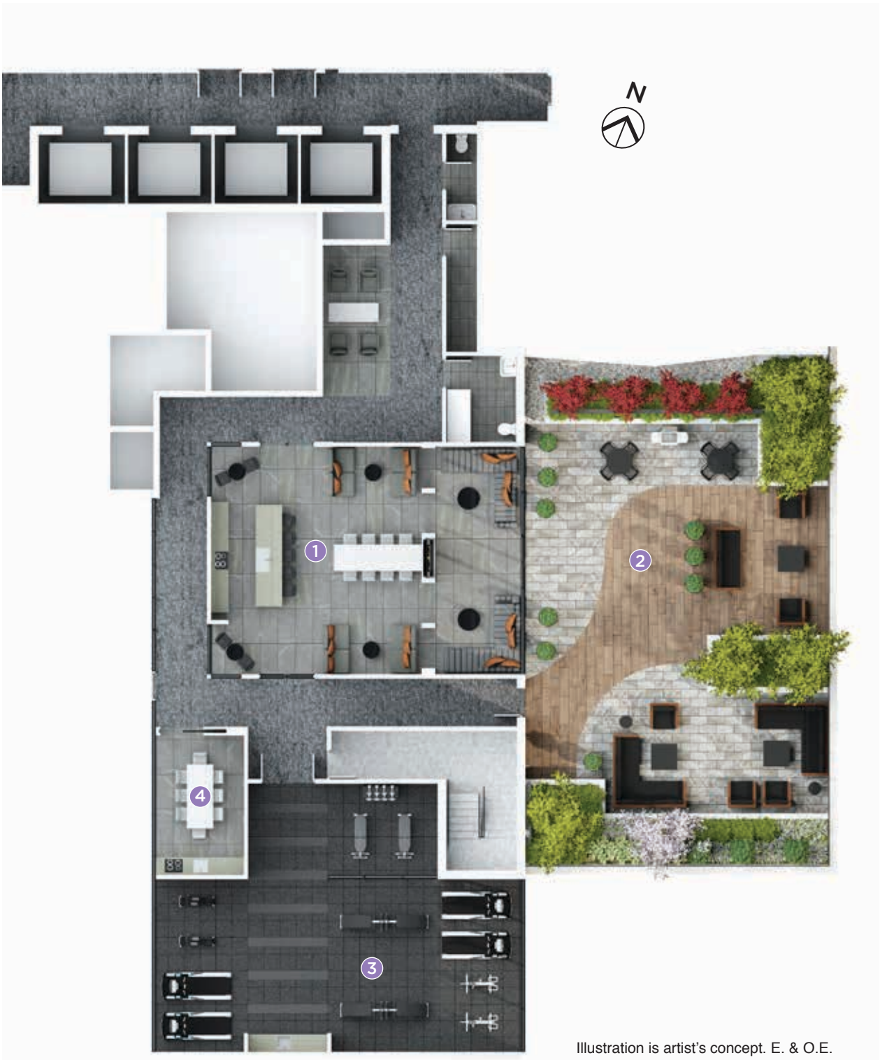
Illustration is artist's concept. E. & O.E.