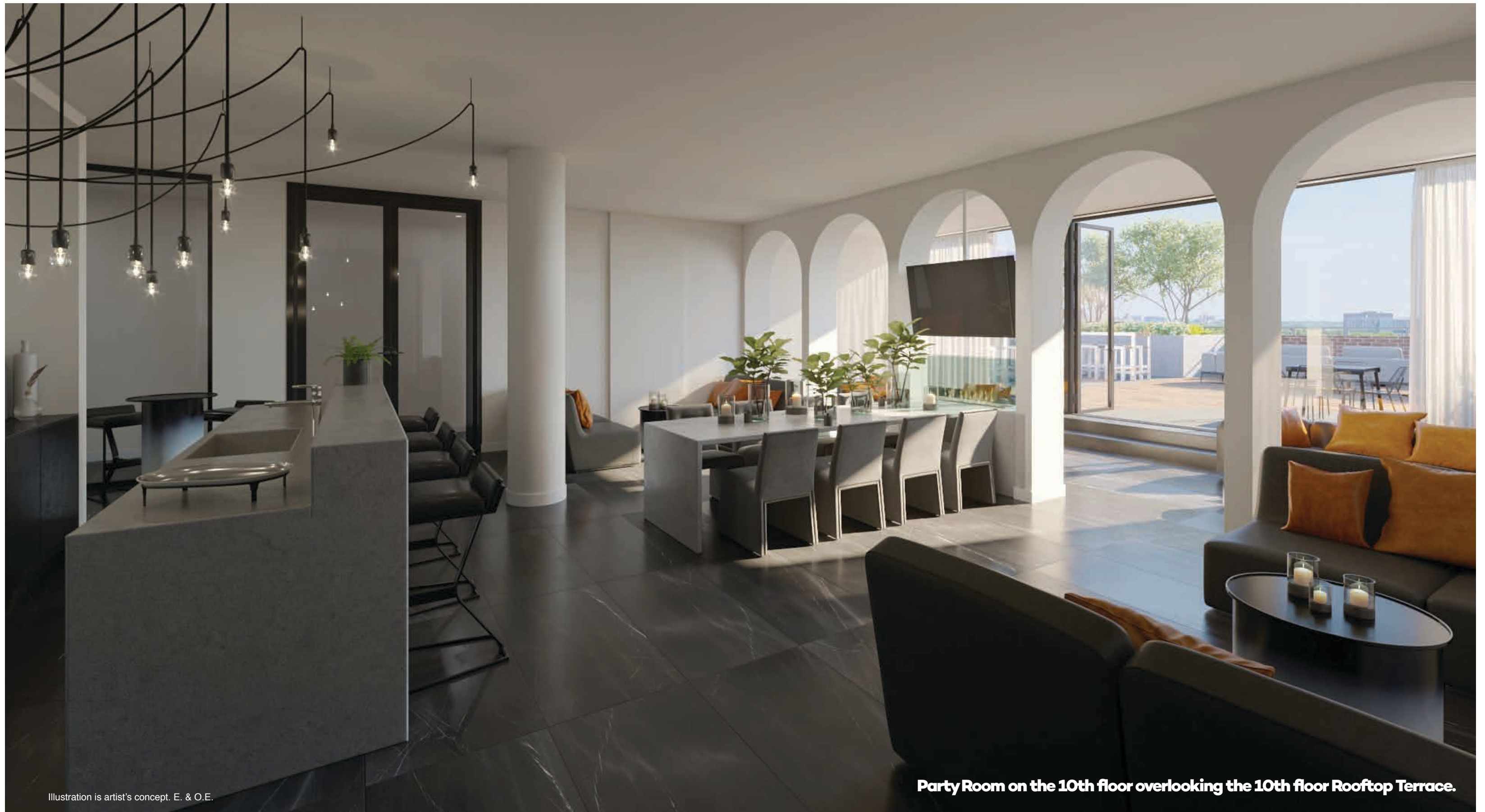
Illustration is artist's concept. E. & O.E.

Party Room on the 10th floor overlooking the 10th floor Rooftop Terrace.